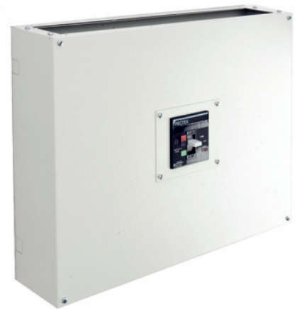
Enclosure for Incomer